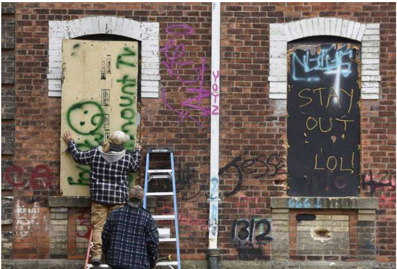
Workers cover a window to secure it at trespass-prone Century Manor.

“There was a real danger that nothing would be done.”