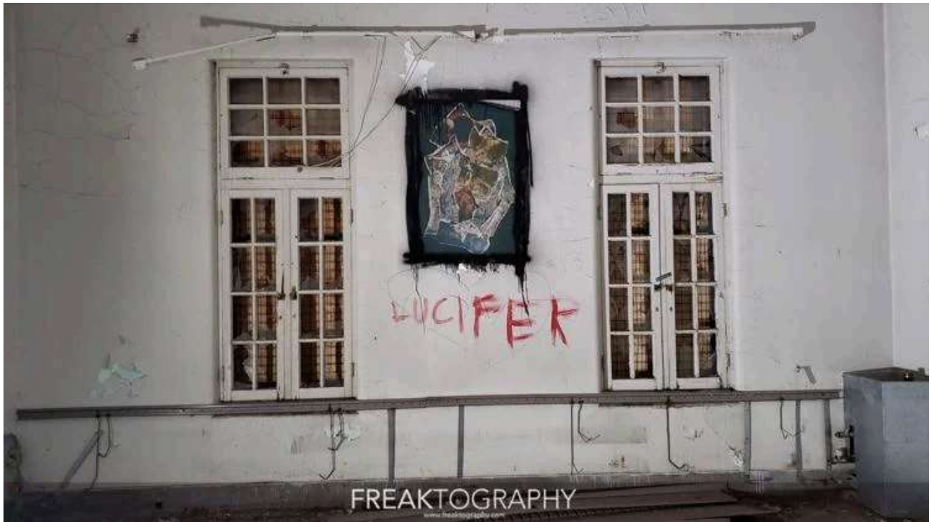
Photos of graffiti inside Century Manor posted by urban explorers.

In 2020, photos shared with The Spectator showed years of satanic-themed graffiti, collapsing floors and ceilings and spreading mould that prompted at least one illicit adventurer to wear a N95 respirator for his visit.